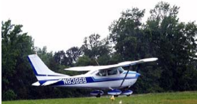
Aircraft #6—Cessna 182, with an on-board integrated high-resolution infrared imaging system

High-resolution, full-time recording and digital imagery make the difference. The cameras used for aerial infrared have four times the spatial resolution of most modern focal plane array infrared cameras, which are used for on-the-ground applications.